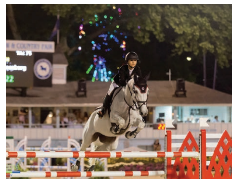
Georgina Bloomberg on Manodie II H at Devon